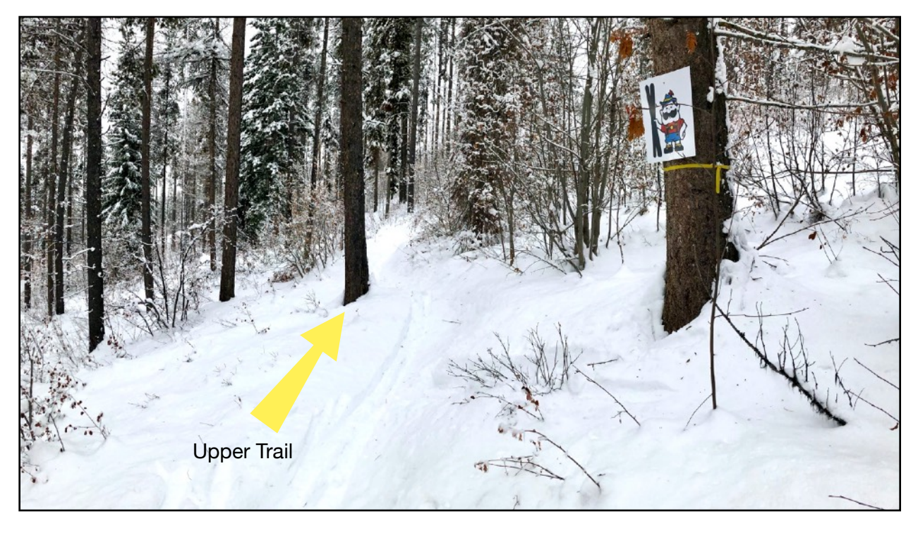
As you ski the loop, be on the lookout for six fun signs hidden along the adventure trail. There are three Happy Hans signs and three winter animal signs to be discovered.