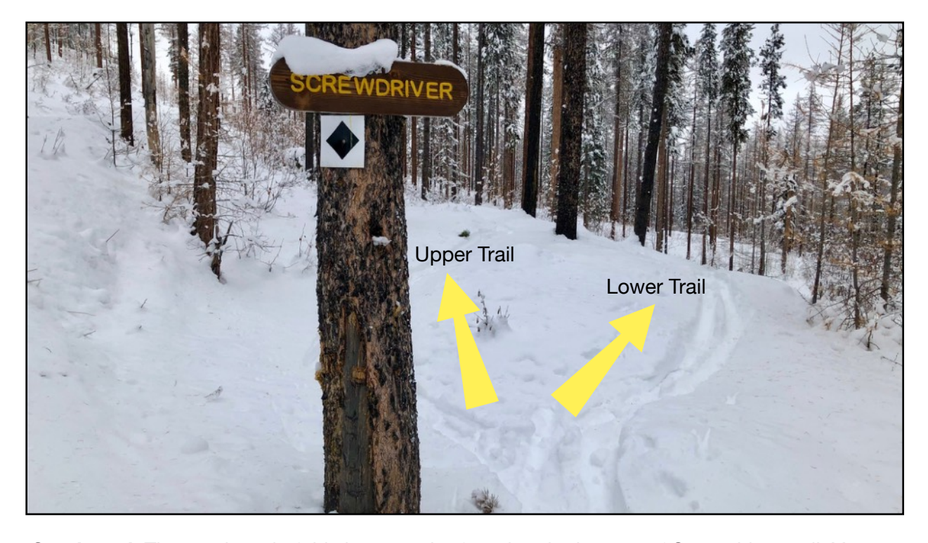
South End: The south end of this loop can be found at the bottom of Screwdriver trail. You can ski the trail in either direction, or pick the upper or lower track for a one-way adventure.