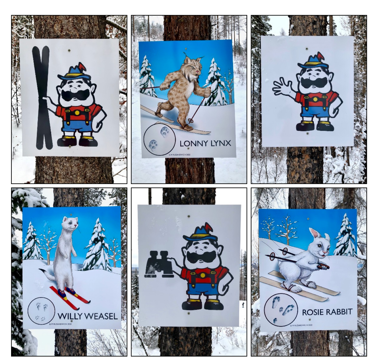
Find all six characters as you ski the KNC Happy Hans Adventure Trail!