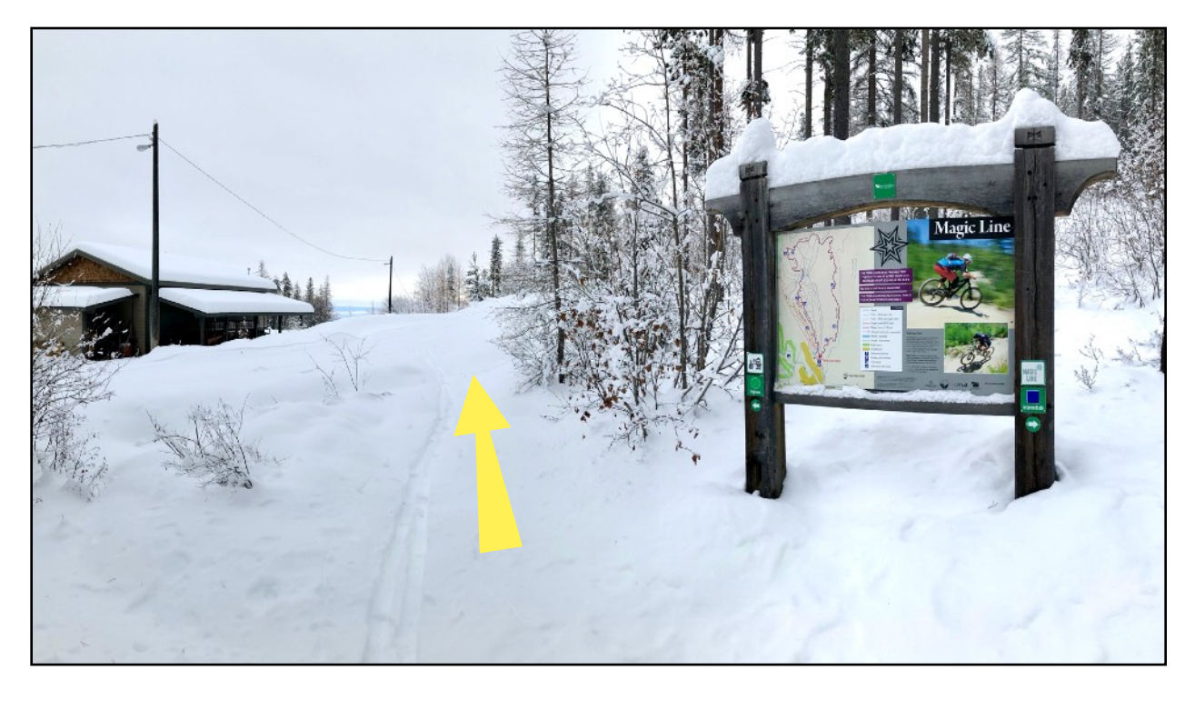
North End: The north end of the loop can be found just behind the groomer garage just above the stadium. Look for the post at the top of the hill behind the garage and pick your trail.